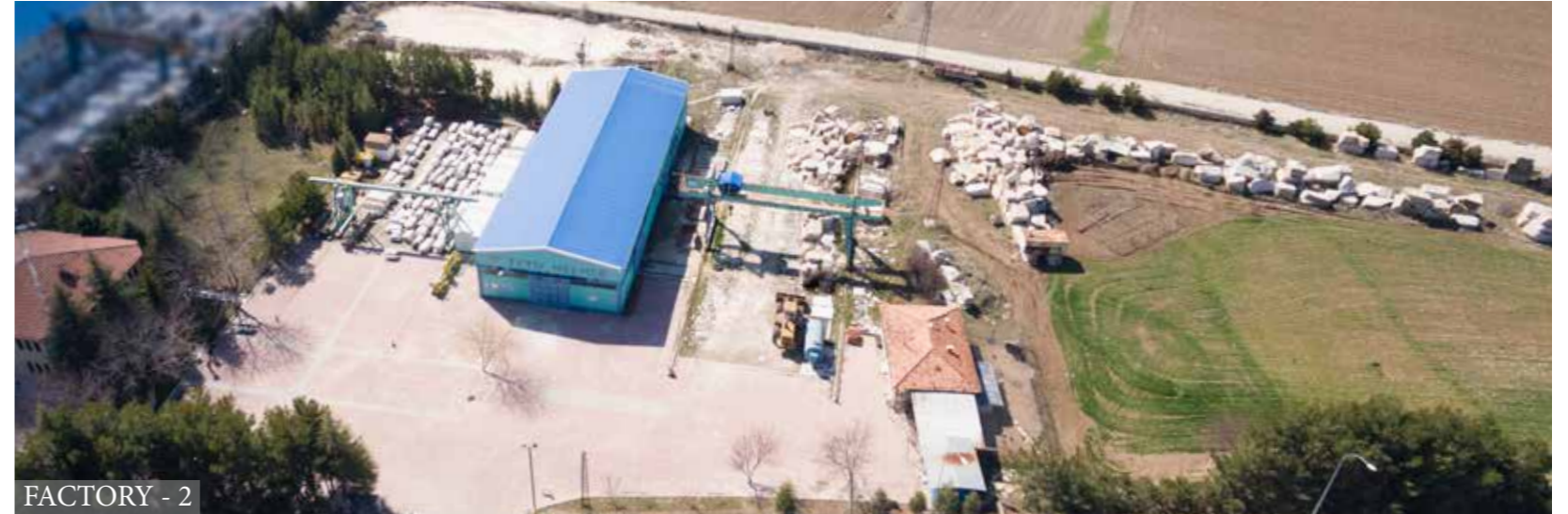
FACTORY - 2