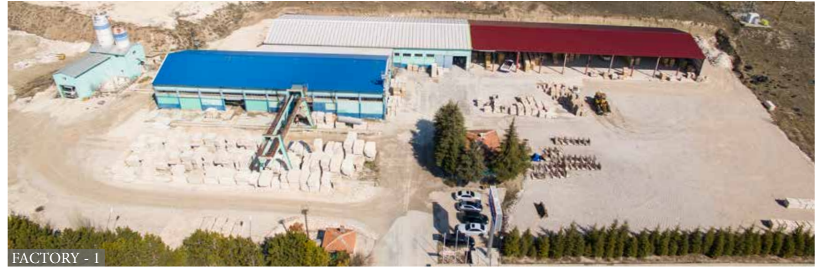
FACTORY - 1